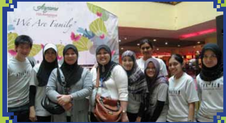
Friendly faces from NKF, staff from Hospital Sultanah Aminah and also Johor Transplant Resource Centre at Plaza Angsana Shopping Mall, JB.