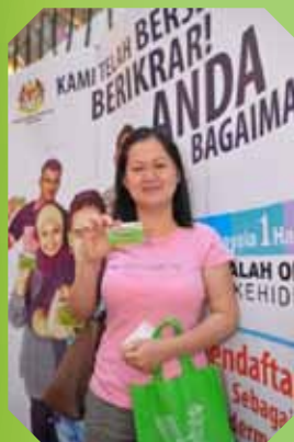
Supportive members of the VW Beetles Club Malaysia and NKF staff had an awesome photography session!