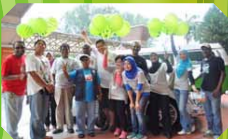
Cheerful crowd at 1Utama with much neon green "Kidneys for Life" balloons up for grabs.