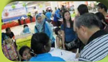
Colouring contest, health exhibitions and fun games session were held in conjunction with WKD 2012 at Parkson Seremban Parade.