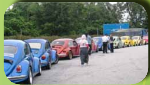
The colourful assortment of vintage Volkswagen Beetles at the Port Dickson toll before heading out to Hospital Tuanku Ja'afar Seremban.