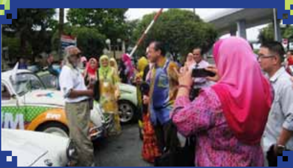
Proud owners of Volkswagen Beetles in Johor showing off their convertibles at the parking lots at Hospital Sultanah Aminah, Johor Bharu in support of NKF Convoy promoting "Organ Donation".

8 March 2012, NKF & Volkswagen Beetles Convoy @ Johor Bharu