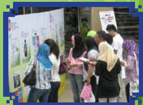
The public participated in the fun games session at the campaign booth. Each participant walked away with goodies supported by our generous sponsors.

9 March 2012, NKF & Volkswagen Beetles Convoy @ Melaka