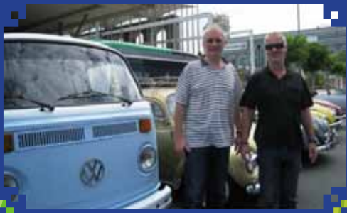
The vintage Volkswagen Beetles & Kombi 1972 displayed at Dataran Pahlawan attracted German tourists to support our cause.