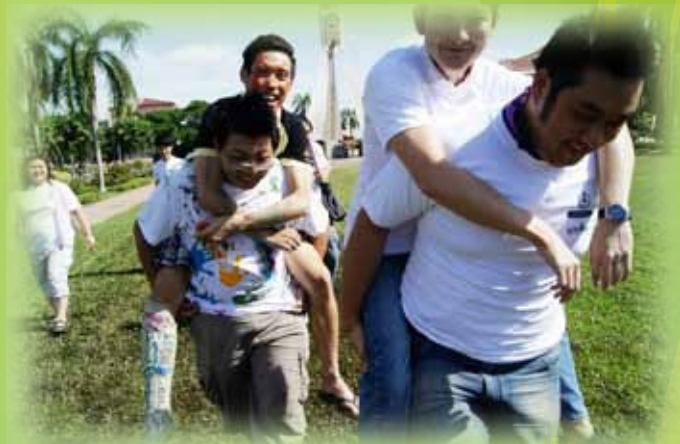
Participants having a feel-good-time at the 400 meter relay run at Dataran Ipoh.