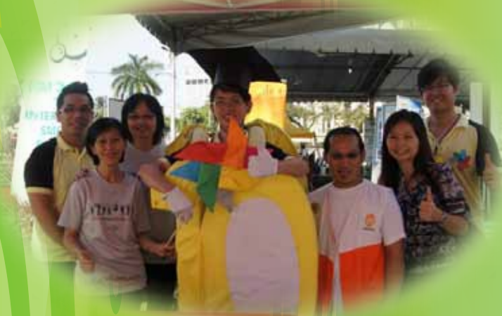
Representatives of NKF and the UTAR Public Relations undergrads having a light moment together.