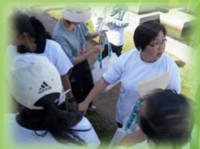
The Staff nurses and dialysis patients from MULS-NKF, Ipoh Dialysis Centre also took part in the run.