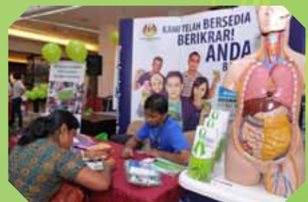
The National Transplant Resource Centre received great and encouraging response from the public on pledging as organ donors!