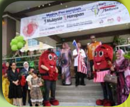
A grand flag-off by Negeri Sembilan State Health EXCO, State Health Director and Hospital Director amidst colourful shower of confetti!

10 March 2012, NKF & Volkswagen Beetles Convoy @ Negeri Sembilan