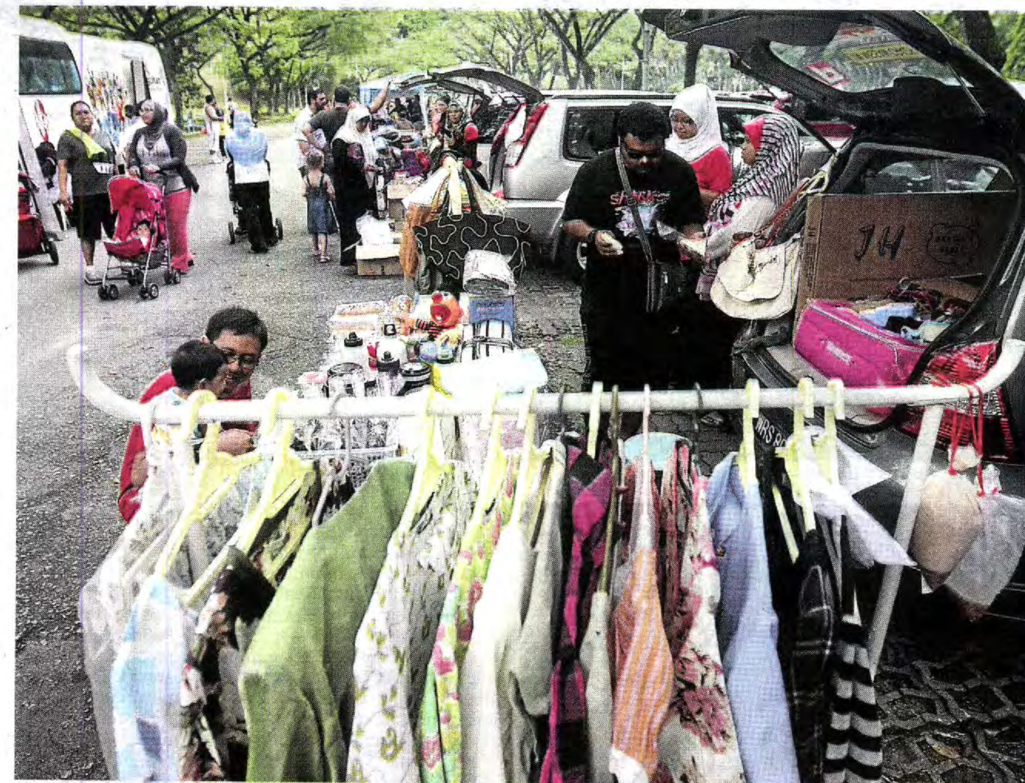
A garage sale in progress.