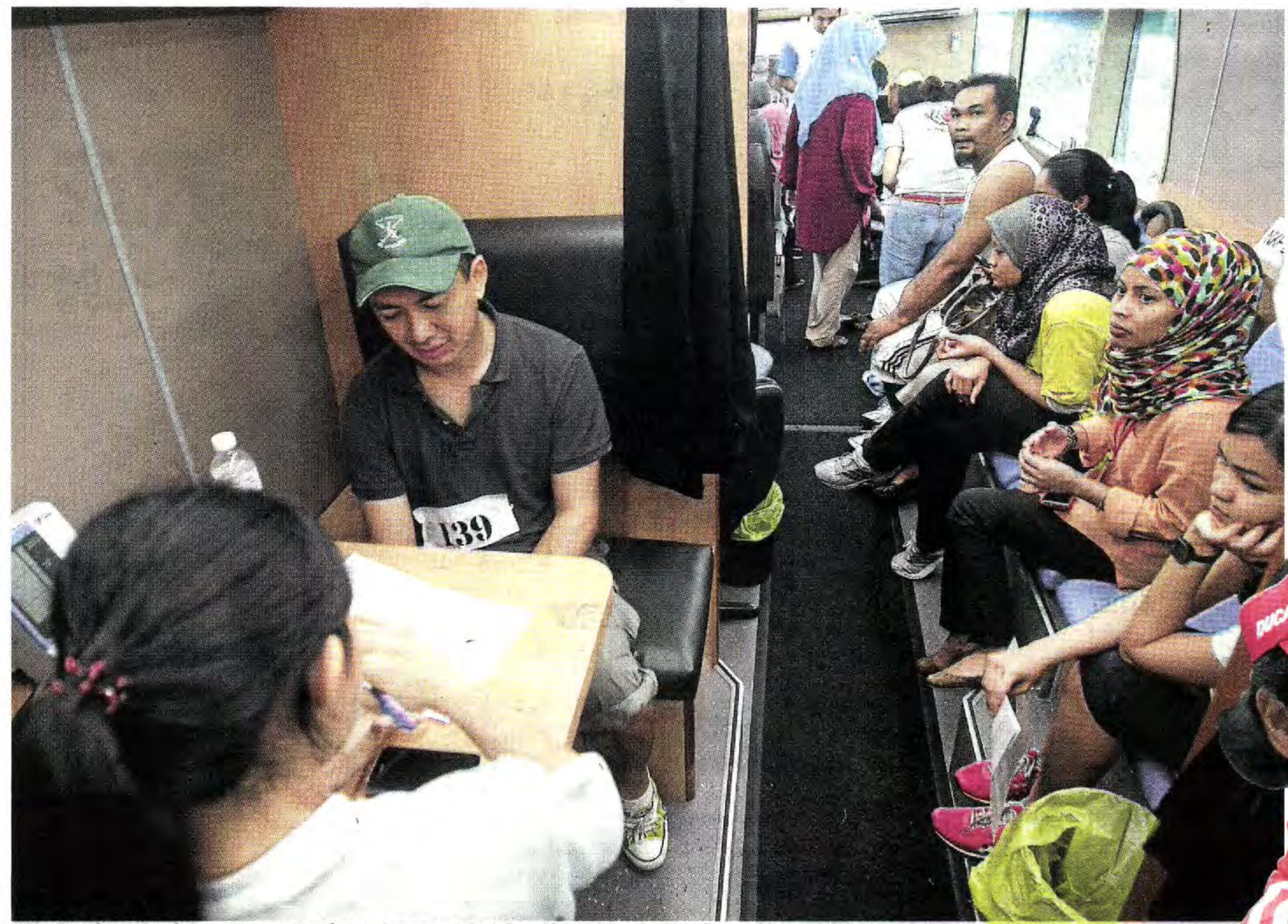
The National Kidney Foundation also provided free health checks from its mobile bus.

"But besides asking for help, I want to create awareness on kidney disease. I want people to learn how early detection can prevent kidney failure, and that it can happen to anyone."