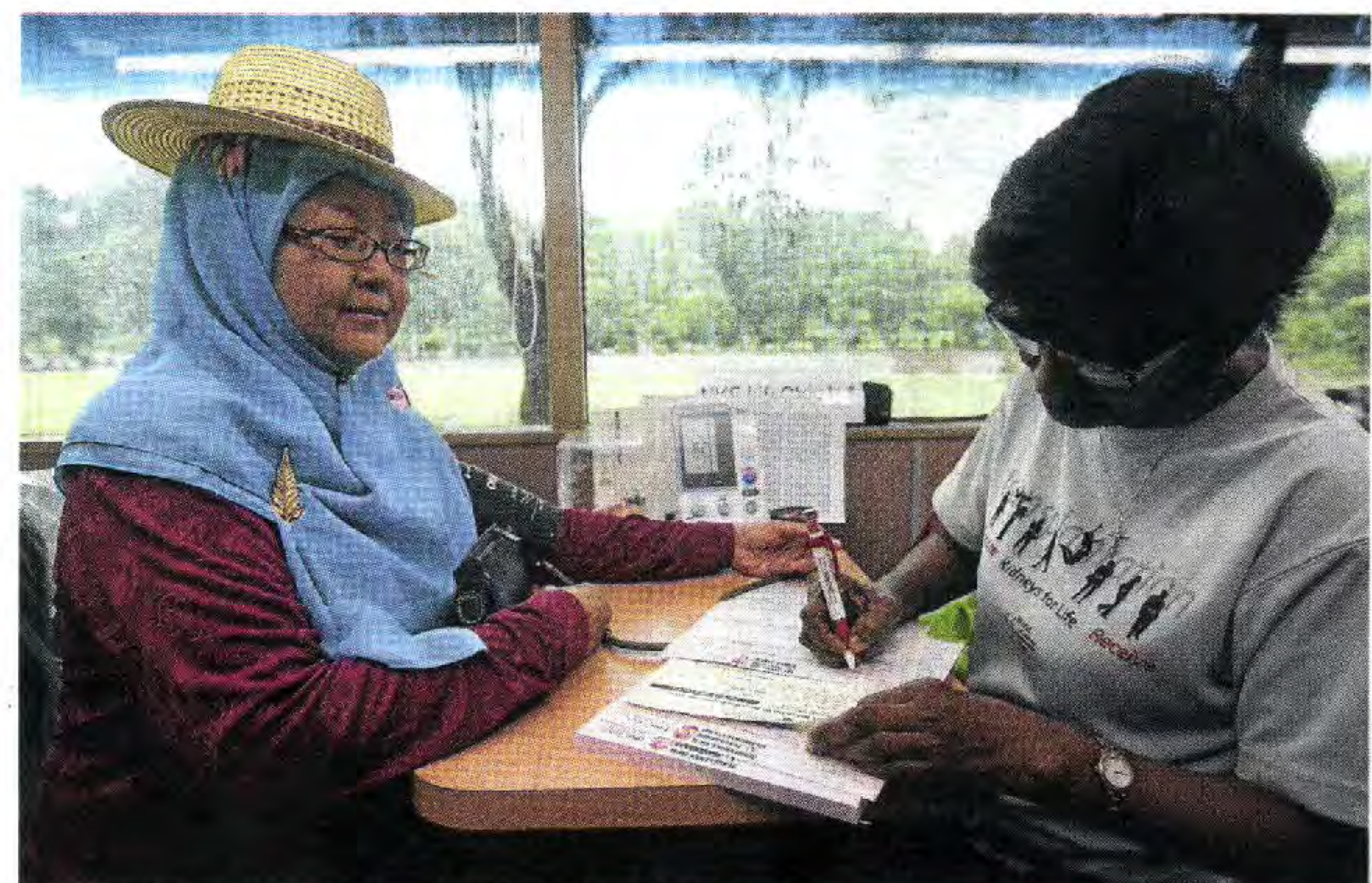
Early screening is a wise investment in health.