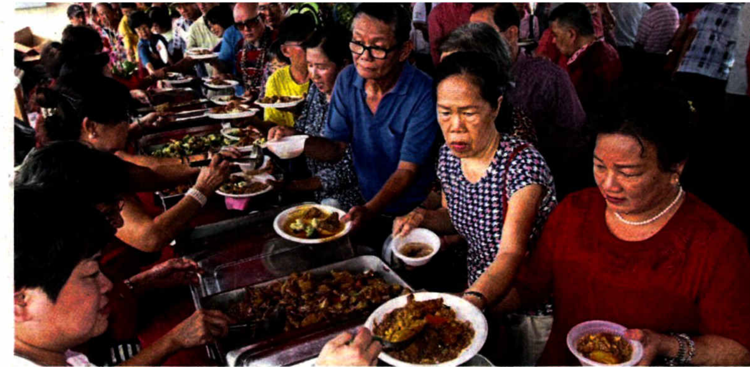
At open house buffets, as seen in this filepic, choose a smaller plate in order to trick your mind that you have eaten more than you actually have.

Feast on good food this Chinese New Year, but try not to overindulge. >3