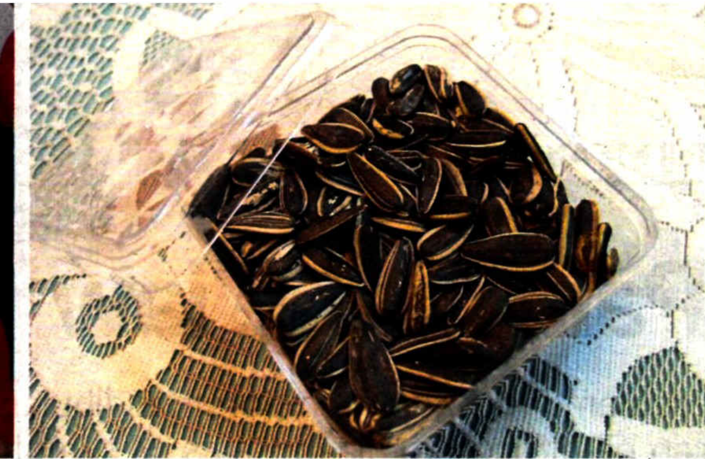
Opt for healthy snacks during CNY, like sunflower seeds, also known as kuaci.

As we usher in a new decade this year, we should note that 2020 is also the auspicious Year of the Rat, which marks the beginning of a new 12-year Chinese zodiac cycle.