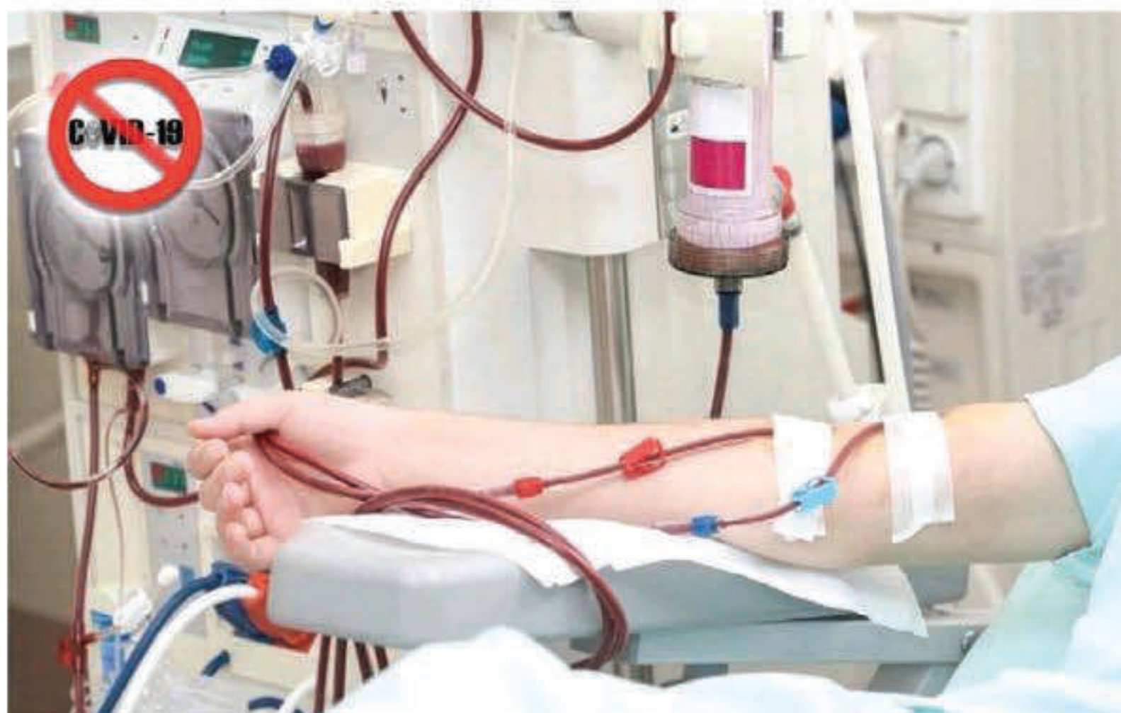
A patient with end-stage renal disease undergoing dialysis treatment to remove toxins, excess salts and fluid from the body.

According to Dr Abdul Halim, the total health expenditure for the public sector dedicated to ESRD care is considered massive