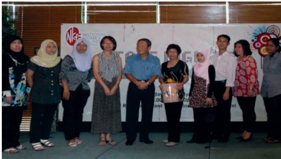
Long Service Award as NKF staff.